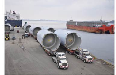
At Hamilton Port. Ready to go.

And what is involved in a move of this complexity, besides detailed logistical strategies and planning, a fleet of specialized equipment and a highly skilled experienced team of experts?